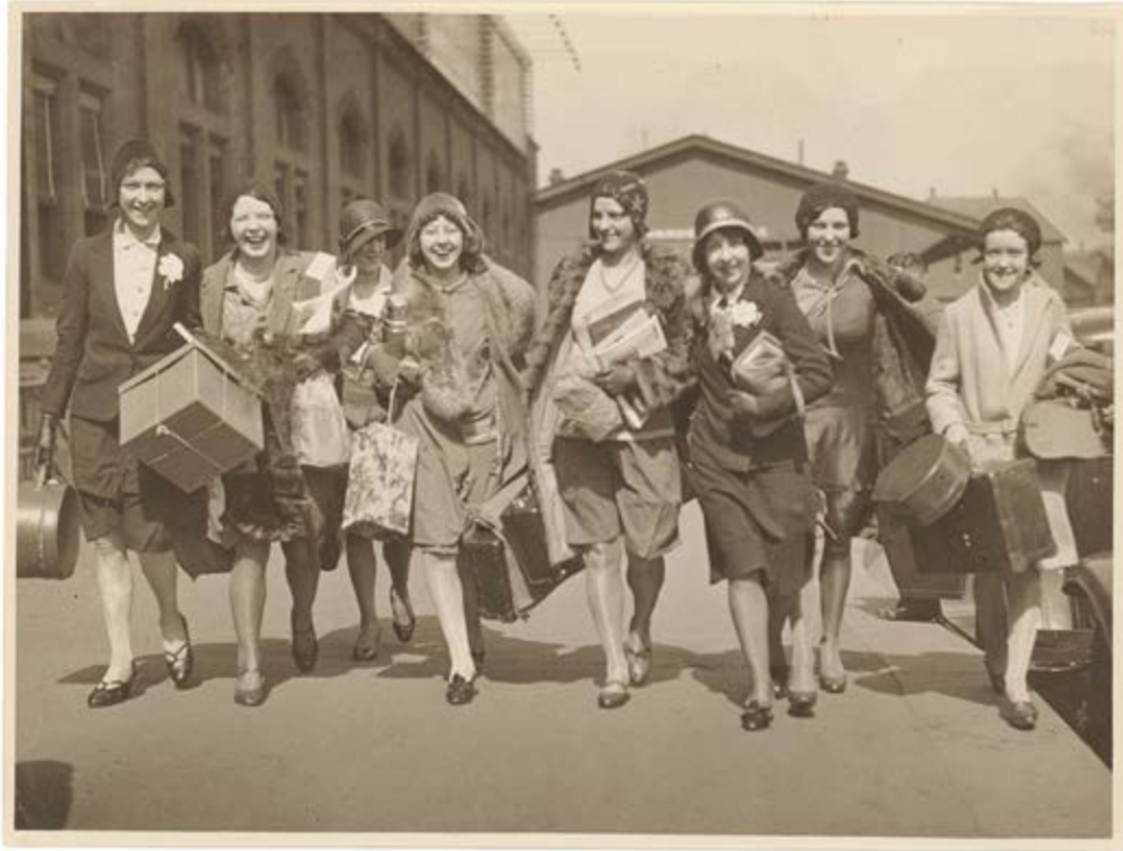
Image: Ingenues